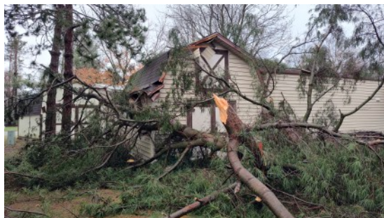
Dee Blair's shed took a hit from a wind topped tree.

The siren sounded at 5:30 pm on Sunday, April 30th. By the time I arrived at the clubhouse, volunteers were already guiding traf-