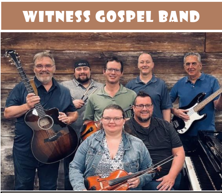
Sunday, June 2 at 6:30 pm Performing gospel music from the lakefront stage. Bring lawn chairs & fingerfood to share after. Freewill offering.

Resort residents are welcome to observe meetings, but are asked to refrain from speaking until the end of the meeting, when there will be an opportunity to address the board. Meeting dates & times will be posted on the clubhouse bulletin board and on Facebook.