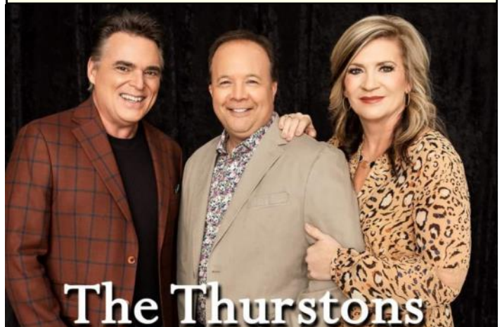
Gospel music concert 6:30 pm Sunday, June 4 Freewill offering. Bring lawn chairs