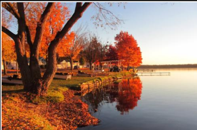
Fall colors peaked the week of Oct. 18. Here's the view looking north of the old boat ramp.