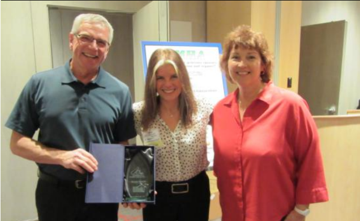
Klines Resort received the "Best Community Activity" Award for our 50th Anniversary Party from the Mich. Manufactured Housing Assoc at their fall convention.