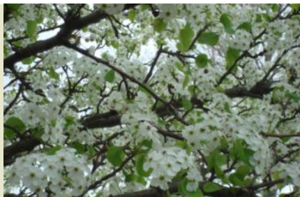
Bees loved our pear tree this Spring

Summer's finally here, although we're still catching up from our crazy winter/spring! Thanks to everyone for your patience. And a big THANK YOU to all you wonderful volunteers who have helped in countless ways.