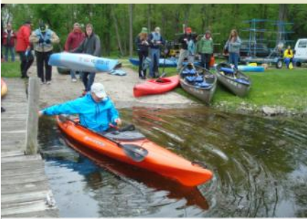
Kayakers prepare to launch

The Open House was a big success thanks to you. And despite the cold weather, the Pedal Paddle group was delighted with the resort, again thanks to the help of so many of you.