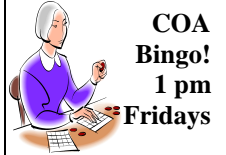
COA Bingo! 1 pm Fridays