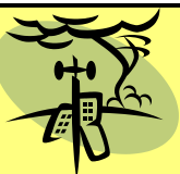
Tornado Siren Test 1st Sat. @ 12:05pm March - October