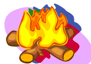
Campfires 5/25, 8/31