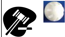
Carers & Sharers Board Meetings 1st Thurs @ 5pm May - Sept General Meetings 2nd Thur after potluck May - Sept Elections on 9/12