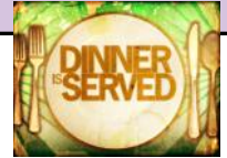
*C&S Dinners* Buy tickets in advance 5/9, 6/13, 7/11, 8/8, 9/12