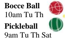
Bocce Ball 10am Tu Th Pickleball 9am Tu Th Sat