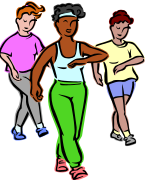
COA Exercise W/F @ 11 Yoga M/W @ 8 Walk Away TThF @ 9 Please verify times