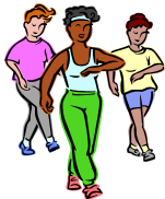
COA Exercise W/F @ 11 Yoga M/W @ 8 Walk Away TThF @ 9 Please verify times