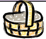
*C&S Dinners* Buy tickets in advance 5/10, 6/7, 7/12, 8/9, 9/13