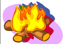
4th Friday Campfires 5/25, 6/22, 7/27, 8/24