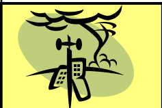
Tornado Siren Test 1st Sat. @ 12:05pm March - October