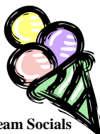
Ice Cream Socials 7/3 C&S @ St. Dance 8/4 C&S Cones @ Fun Day 9/2 after Gospel Concert